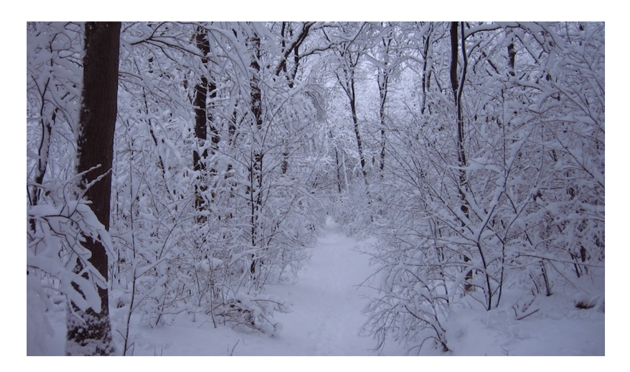
Merry Christmas and a Happy 2022!